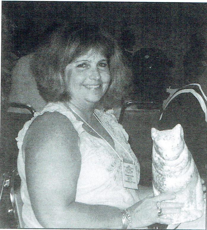
Becky Souder Blue/White Spongeware Cat